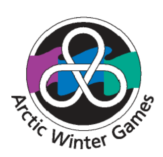
logo with logo type