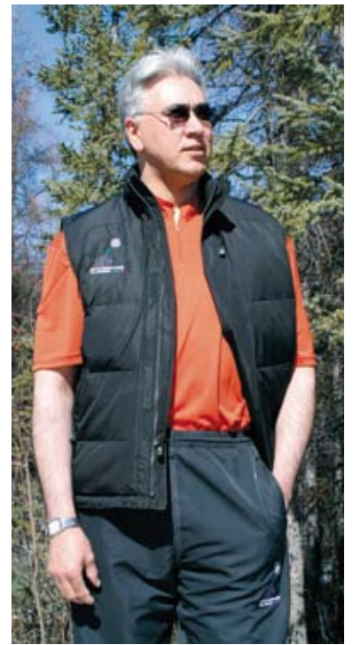
Deputy Premier and Inuvik Boot Lake MLA, Floyd Roland looking every bit the supermodel in an orange zip mock neck shirt, black down vest, and lightweight track pant with peek-a-boo blue zip at the ankle (also available in peek-a-boo red, and white pant with peek-a-boo red).