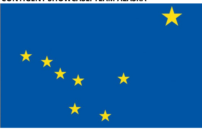
2023 ULU NEWS | GRAPHIC SUPPLIED