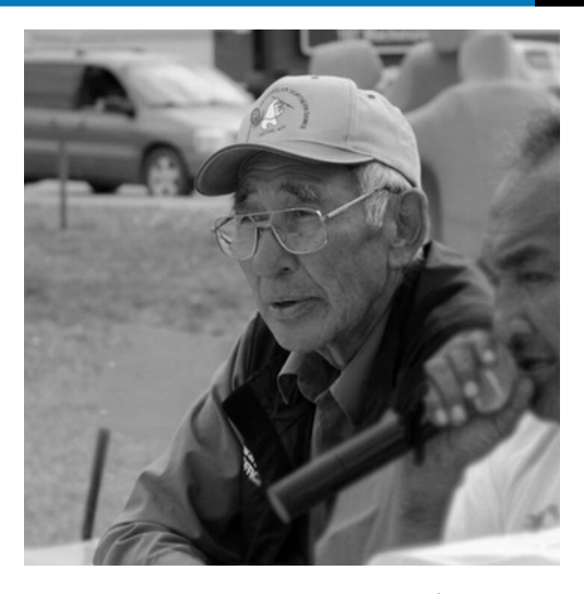
Edward Lennie, known today as the "Father of

There have been many successes along the way. A significant milestone was reached in 2010, when Arctic winter sports were included as a demonstration sport in the 2010 Olympic.