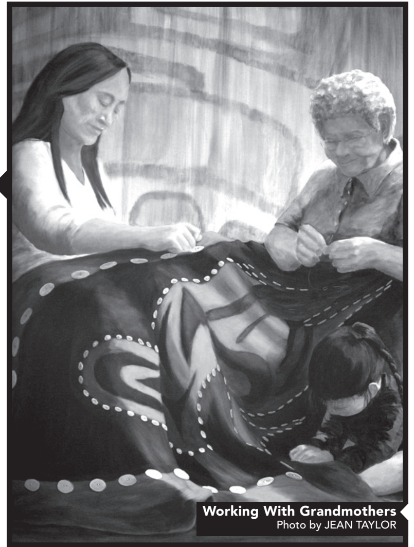
Working With Grandmothers