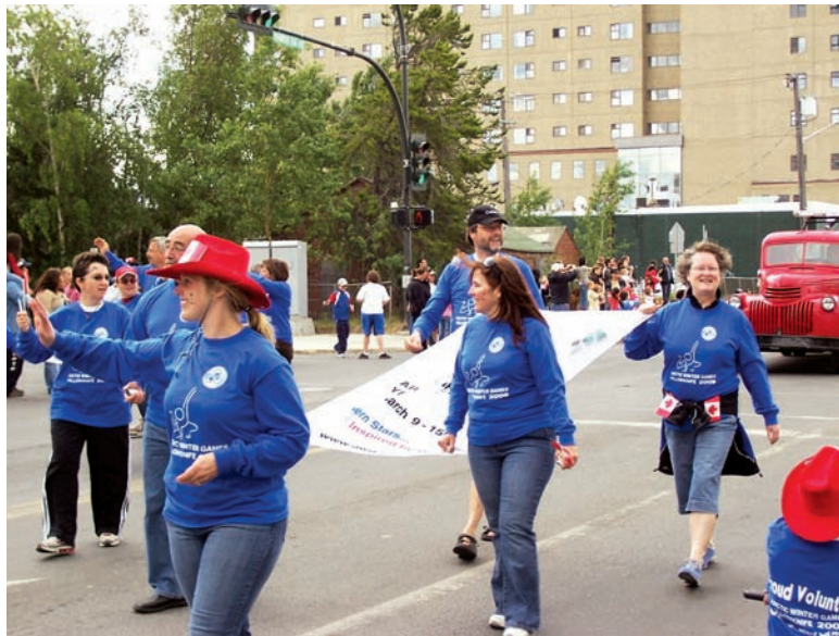
Volunteers rev up the crowd at the Canada Day Parade.