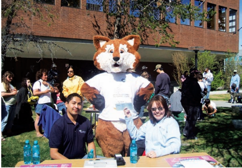
Foxy and friends sell raffle tickets at the Miners' Picnic in June.