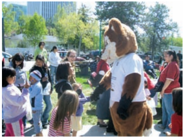
Foxy meets some young fans at the Miners' Picnic.