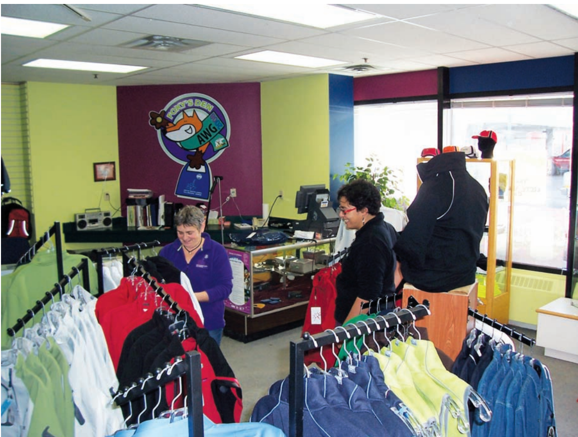
Foxy's Den offers up the official AWG merchandise and accessories for the 2008 Games.