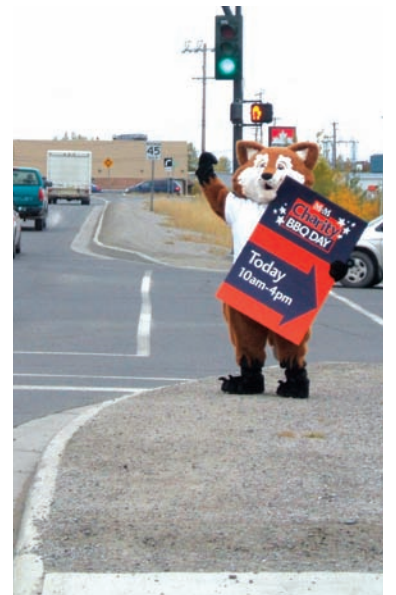
Foxy enticing drivers to stop by the M&M Meat Shops barbeque on a blustery Saturday!