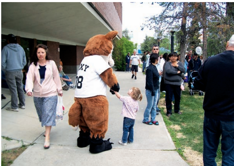
Foxy makes a young friend at the City's 40th Anniversary picnic.