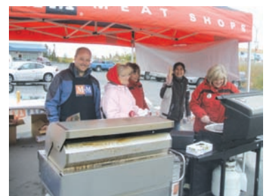
Intrepid volunteers cooking hot dogs and hamburgers at the M&M Meat Shops barbeque.