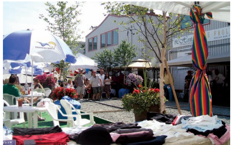
The petanque tournament in full swing at Bastille Day.