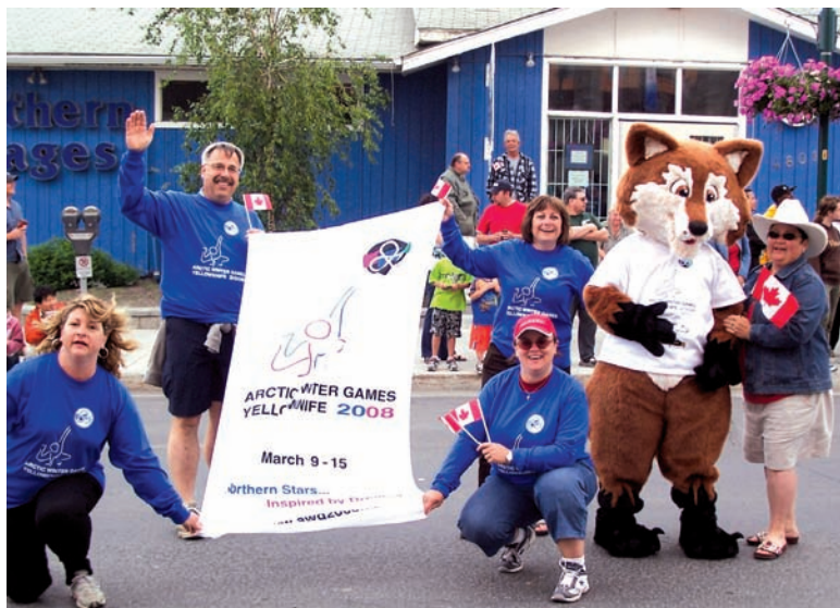
Proud volunteers with the AWG flag and Foxy at the Canada Day Parade!