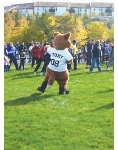
Foxy leading the crowd in stretches before the Terry Fox Run.