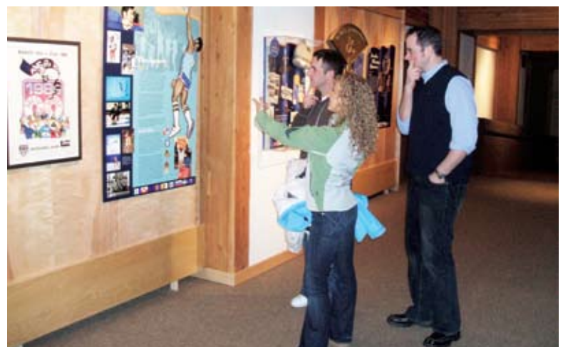
Perusing the Alaska State Museum AWG Exhibit.