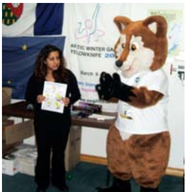
Foxy is shown how to properly clean his hands!