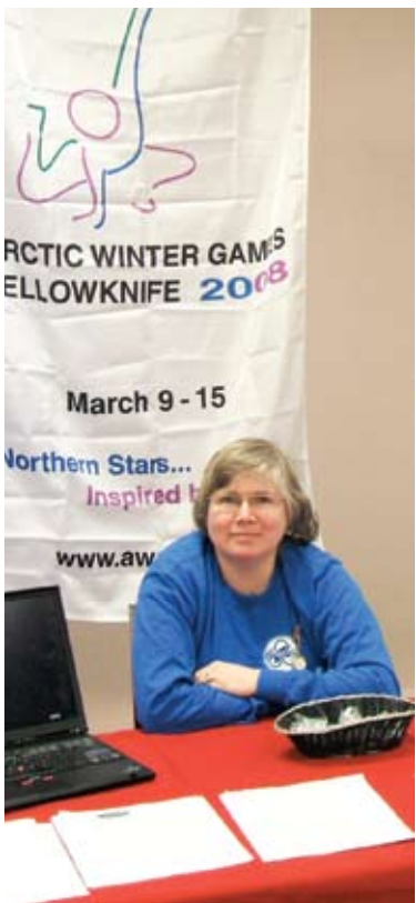
A proud volunteer manning volunteer registration at the Tree of Peace.