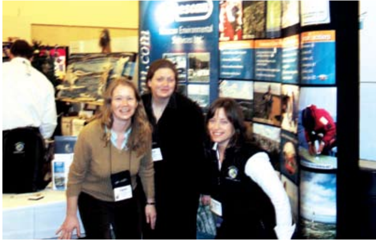
Staff from Rescan Environmental Services are happy to be proud sponsors of the Games.