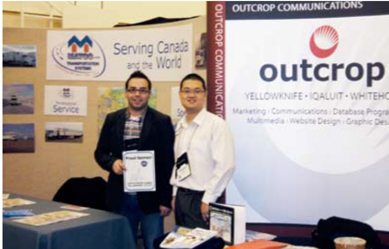
Staff from MATCO and Outcrop teaming up to show their support.