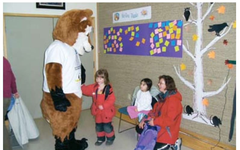
Foxy makes some new friends at the Baker Community Centre.