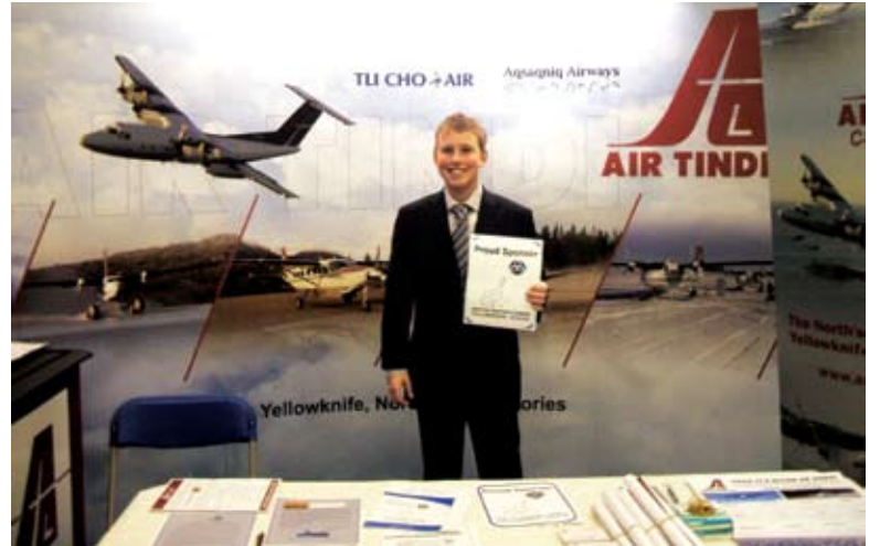
Air Tindi making sure we know they're proud sponsors.