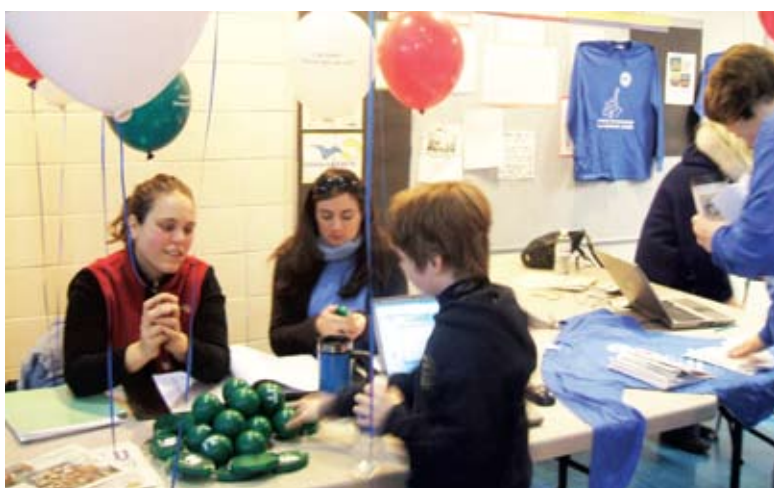
Signing up volunteers at the Multiplex!