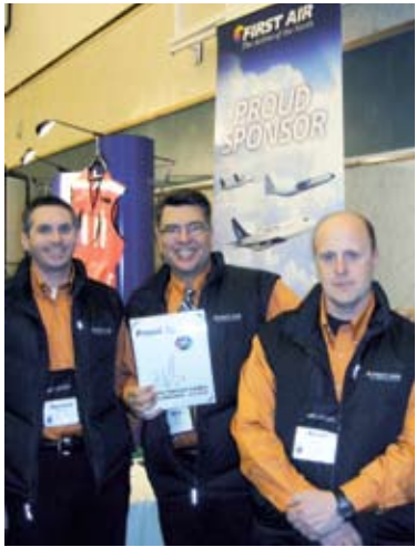
First Air with big smiles at the Geosciences Forum.

And we continue to bring the Games to the community! The last couple of months have been all about the final volunteer drive and accreditation and all of the details to make sure the 20th Games are the best ever!