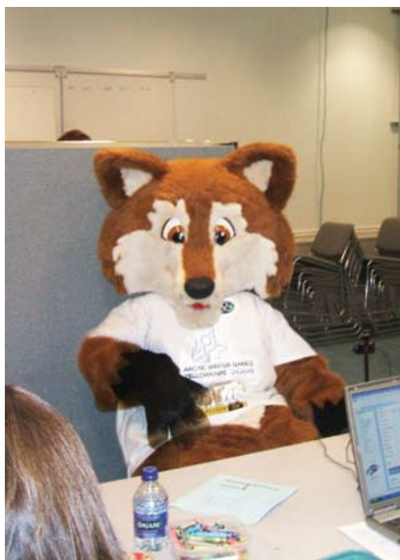
Foxy gets his picture taken for accreditation!