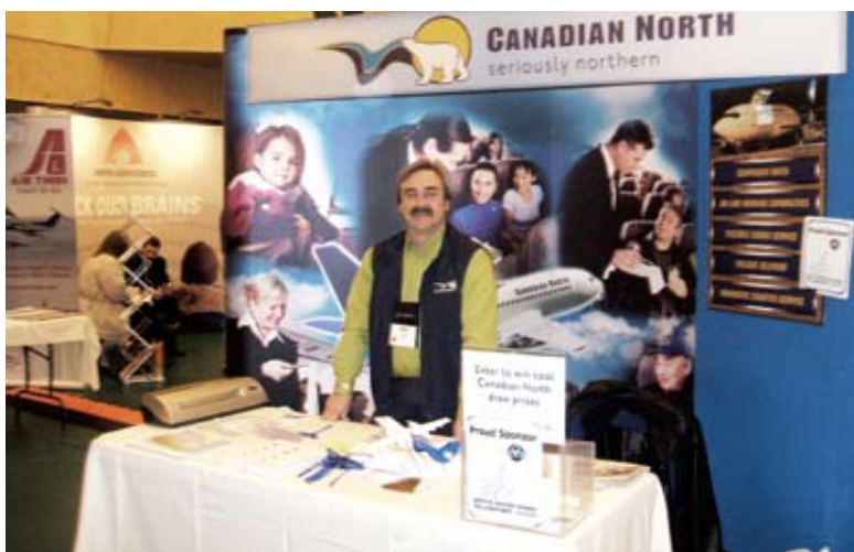
Canadian North at the Geosciences Forum with their AWG proud sponsor sign.