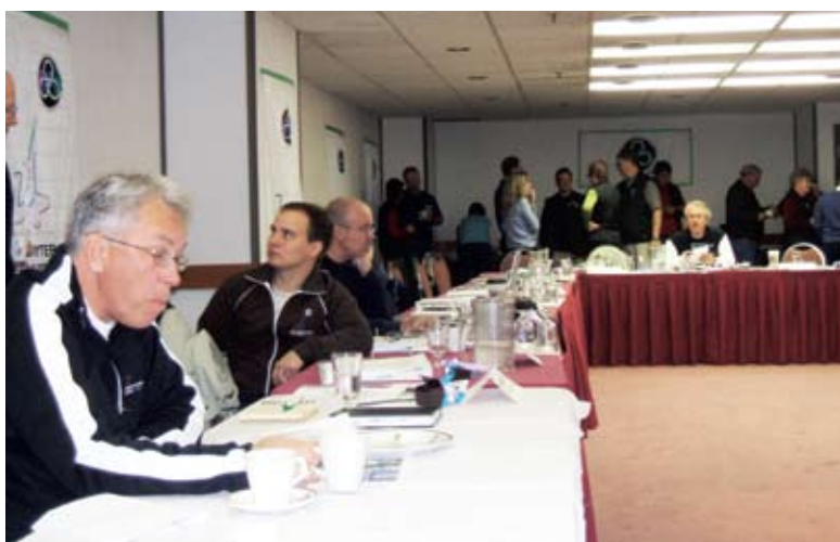
Planning, planning, planning at our chef's and international committee visit.