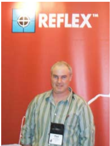
Reflex standing tall with their proud sponsor sign at Geosciences.