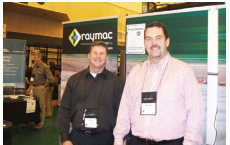
The Raymac fellows with their proud sponsor sign.